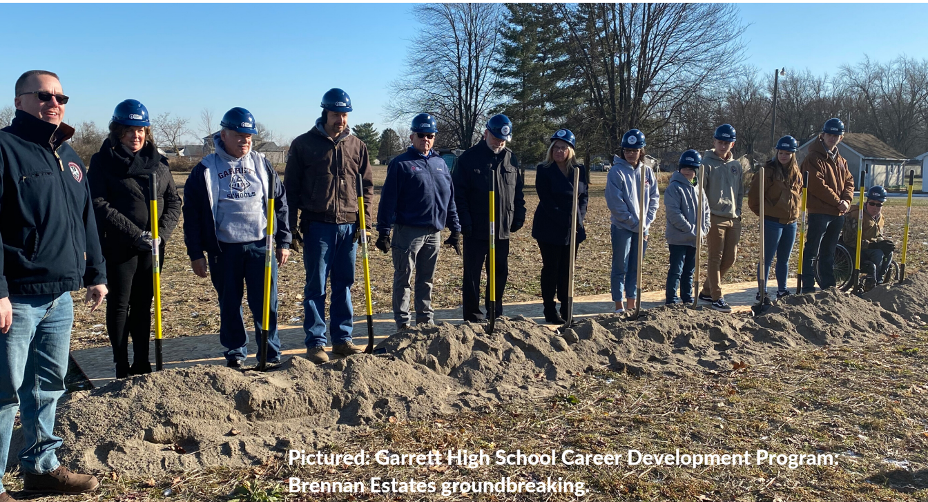
Pictured: Garrett High School Career Development Program: Brennan Estates groundbreaking