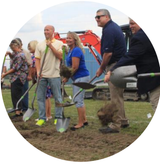
Groundbreaking of Veteran's Memorial Park in Waterloo.