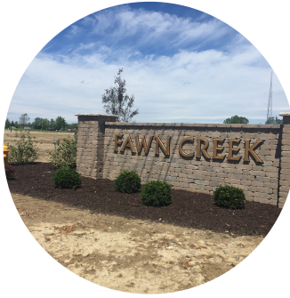
Fawn Creek Estates broke ground in DeKalb County.