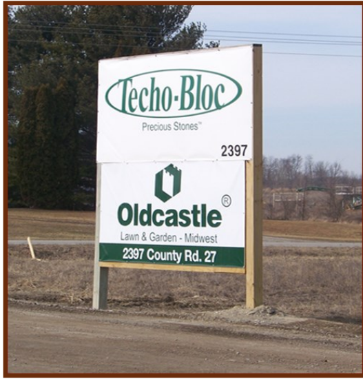
Techo-Bloc is a Canadian owned landscape and masonry manufacturer that chose the Waterloo area to locate their new Midwest operations and pledging 95 new jobs.