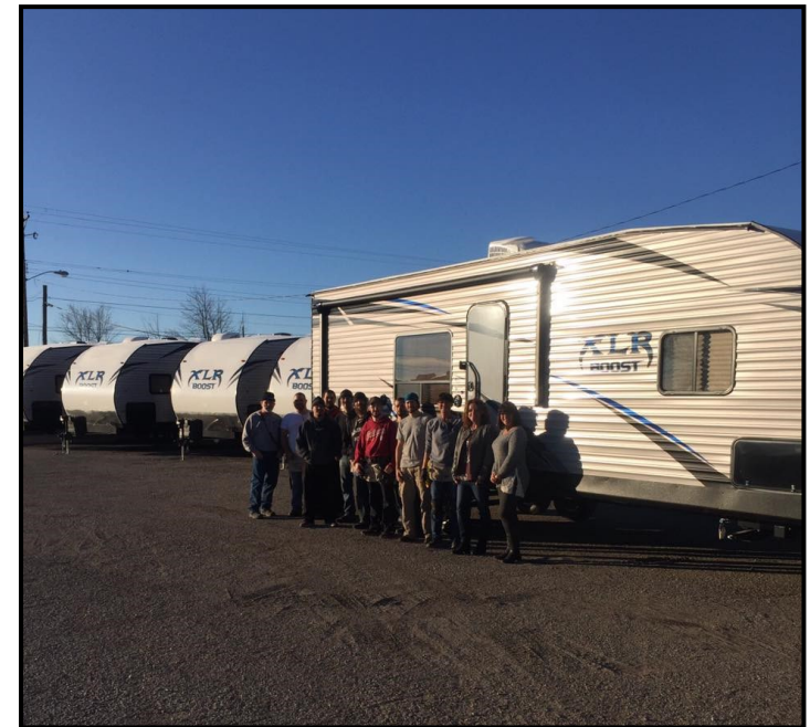
Forest River in Butler, Indiana sending out their first toy hauler.