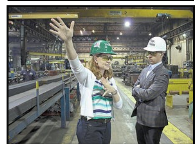
U.S. Congressman (IN-03) Jim Banks tours Nucor in Waterloo, IN.